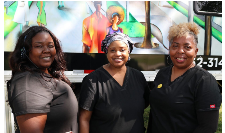
Opening Day at the Plan A Clinic.

June The brick-and-mortar clinic opens in Louise, MS, expanding our services to include primary care and women’s health services not possible in a mobile setting.